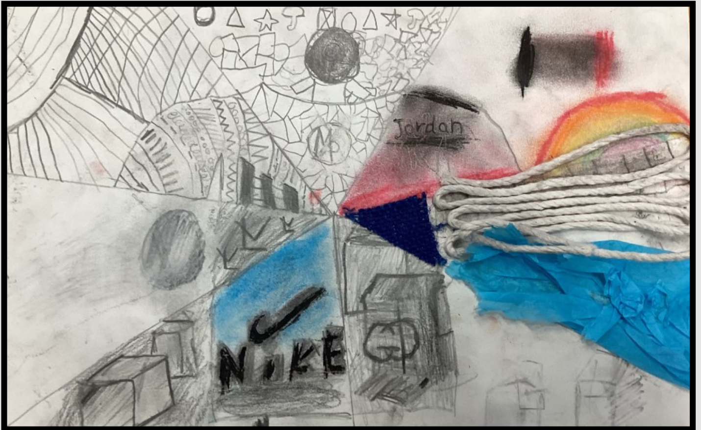
Lovely art work Year 5!